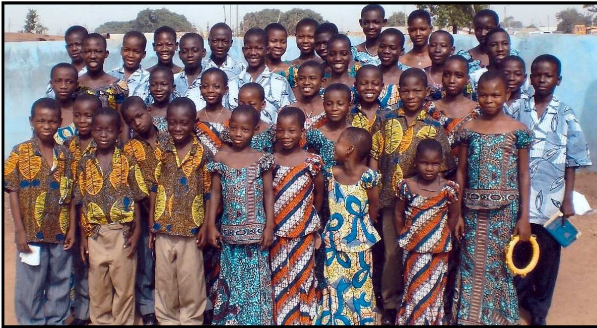
Our children from the Sawla Children's home in their new clothes they received at Christmas.