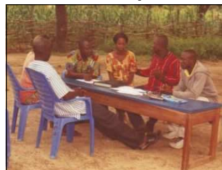
Staff planning the new Sawla Children's Home.